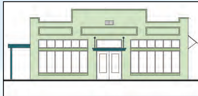
(right) Artist's sketch of the remodeled Recycling Facility. It will be restored to the way the building appeared when it was used as an auto dealership.