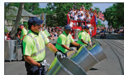
(left top) Buddy Blue energizes the crowd as the drill team and vintage truck parade by during the May Fair Parade.

The Recology Dixon team walked away with three first-place awards for the May Fair Parade. The Drill Team, Vintage Truck and "Buddy Blue" mascot were given top awards by parade judges.