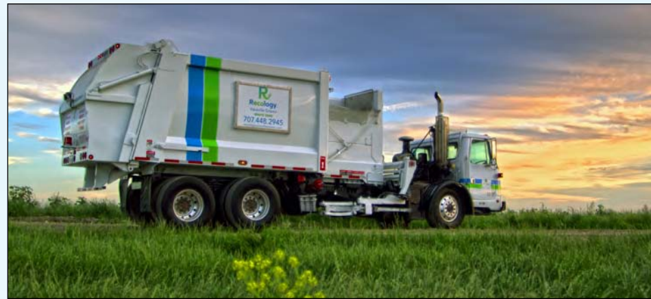
Recology is changing everything! Recology trucks are painted periodically, so customers will notice this beauty above working residential routes in Dixon. Look for it in your neighborhood!

Plastic bags must never be placed in the green yardwaste or blue recyclables Toters®. Plastic bags should be returned to the store or placed in the gray trash Toter®. Only leaves, grass clippings, weeds, vegetables, bread, fruit, and tree or shrub prunings may go inside the green Toter®. No other materials may be mixed with your yardwaste.