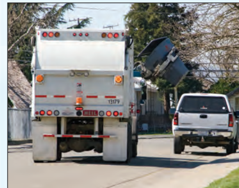
Use extra caution when approaching or passing working Recology trucks. Children, pets, and other dangers can be difficult to spot; so be careful driving near or around trucks.