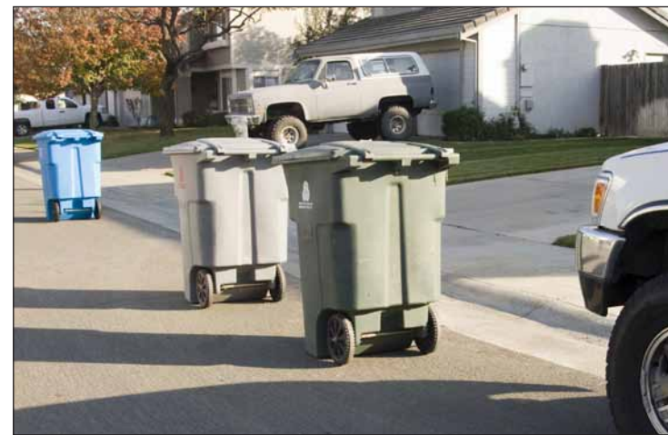
There are new rules for Toter ® placement in Dixon. Check on the inside pages for a description of the way to properly set out your containers.

Please refrain from raking leaves into the street and properly contain leaves for recycling or debris for disposal. Only water should go in the storm drain system. For more information call 1-800-CLEANUP.