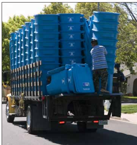
New blue recycling Toters® were delivered to Dixon homes in late March. With the delivery, Dixon joins the other Solano County communities that are recycling through curbside service.