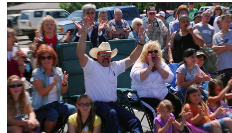
Help cheer on the DSS Drill Team at the Dixon May Fair Parade on Saturday, May 10. The precision team will execute a number of complicated maneuvers that are choreographed to lively music.

Be sure to look for the Dixon Sanitary Service Drill Team and cheer us on during this year's Dixon May Fair Parade!