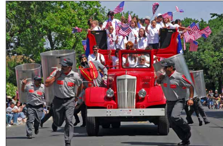
The Drill Team runs drills during last year's Dixon May Fair Parade while family members and employees from Dixon Sanitary Service cheer them on.

Dixon Sanitary Service employees are in high gear preparing for the 133 rd Annual Dixon May Fair Parade. This year's parade will be held on Saturday, May 10, in downtown Dixon. The ever-popular Dixon Sanitary Service Drill Team is brushing up their marching skills and polishing their vintage trash cans for their upcoming performance. The DSS Drill Team has been an exciting addition to the parade for many years. Route drivers and other employees run cadence style drills while carry-